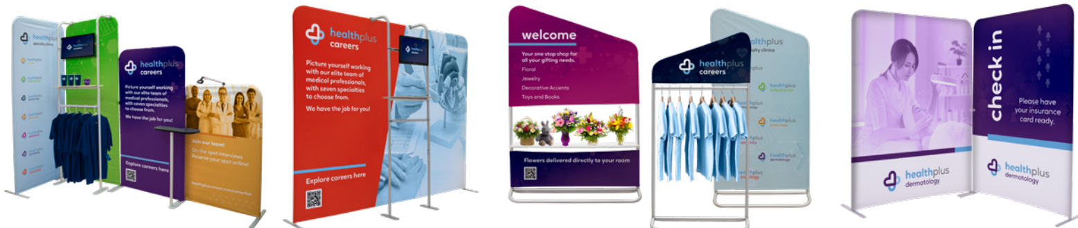
Add some character to any backdrop by mixing and matching various sizes and accessories.